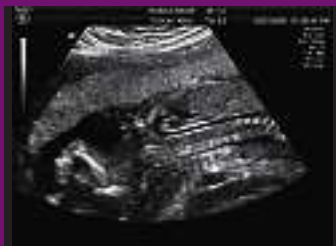
Fetal aortic arch with SRI high