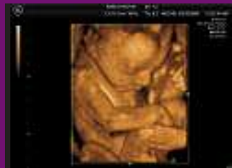
Surface rendering of fetus