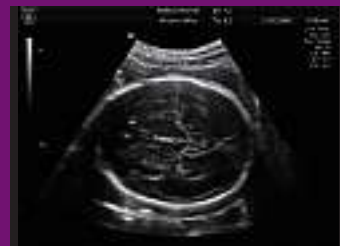
2D intracranial anatomy with SRI low