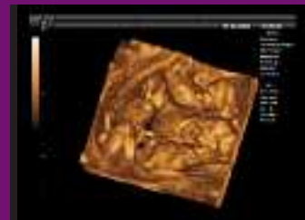
First trimester triplet gestation