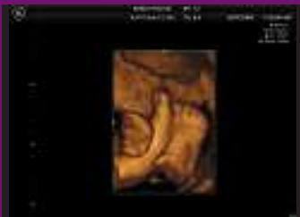
3D rendering of fetal feet